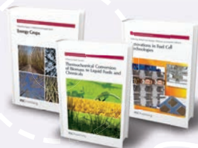
RSC Energy & Environment Series