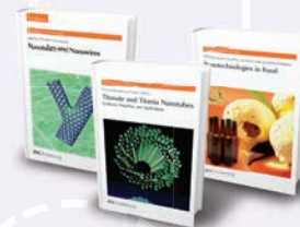
RSC Nanoscience & Nanotechnology Series