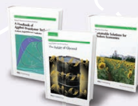
RSC Green Chemistry Series