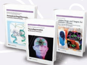
RSC Drug Discovery Series

Cutting-edge high-quality content, outstanding excellence across the chemical sciences and beyond, the RSC continues to lead as one of the fastest chemical sciences print and online book publishers in the world. For postgraduates up to faculty members, our professional reference series provide authoritative coverage in a comprehensive range of subjects including: