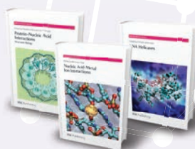
RSC Biomolecular Sciences Series